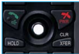
Easy Menu Navigation Joystick