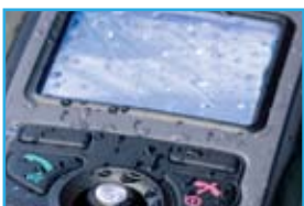
Dust & Splash Resistant

The KX-TD7696 boasts a large, 6-line, blue backlit LCD and includes all the features you'd expect such as Caller ID, personal and system speed dials, and a built-in 100-entry phone book and distinct ring/LED options. The handset includes an intuitive Graphical Icon Menu and dynamic Operation Guidance with Soft Keys and a Built-in Joystick.