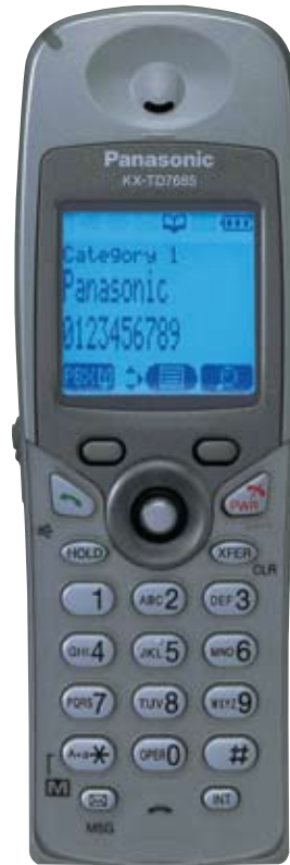
KX-TD7685 Standard Model