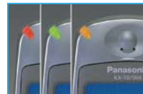
LED Call Indicator