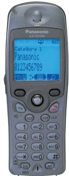
KX-TD7695 Compact Model