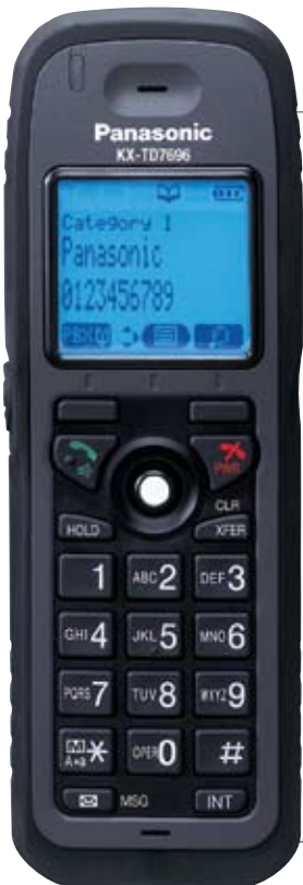
KX-TD7696 Ruggedized Model