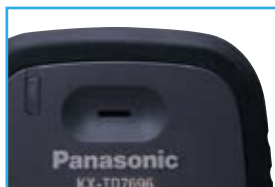
Shock-Resistant, Ruggedized Design